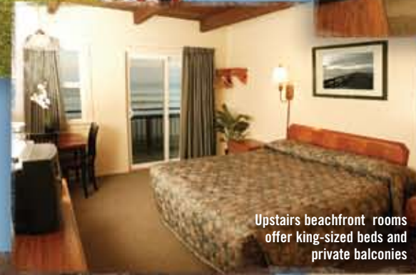
Upstairs beachfront rooms offer king-sized beds and private balconies

BEACHFRONT ROOMS Our beachfront building offers upstairs rooms including one king-sized bed and a private balcony overlooking the Pacific. One of the rooms has a fireplace. Each downstairs room has two double beds, along with direct access to the lawn area and the beach beyond.