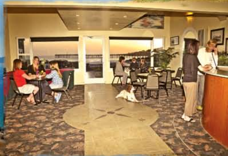
Friendly staff will help your stay be enjoyable and memorable. Pets welcome.