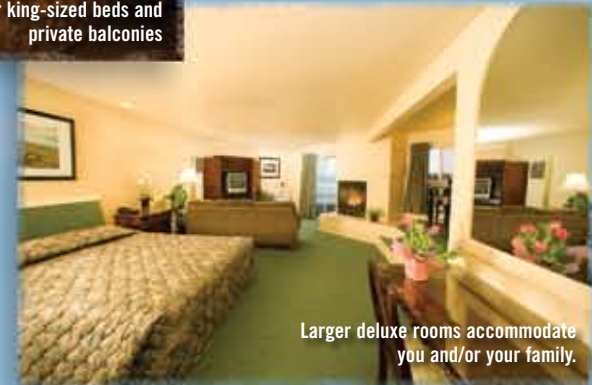
Larger deluxe rooms accommodate you and/or your family.

DELUXE ROOMS Our spacious deluxe rooms feature a variety of bed combinations, with private patios or balconies. Two rooms offer cozy fireplaces with stunning ocean views.