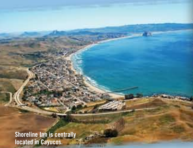
Shoreline Inn is centrally located in Cayucos.